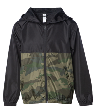
Black / Forest Camo