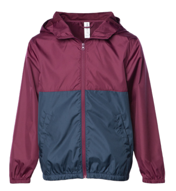
Maroon / Classic Navy