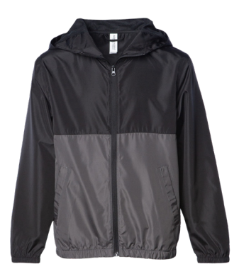
Black / Graphite