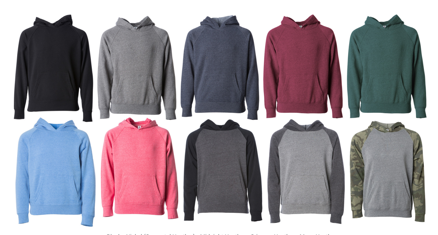
Black • Nickel (Gunmetal Heather) • Midnight Heather • Crimson Heather • Moss Heather, Pacific Heather • Pomegranate Heather • Carbon(Charcoal Heather)/Black • Nickel(Gunmetal Heather)/Carbon(Charcoal Heather) • Nickel (Gunmetal Heather)/Forest Camo