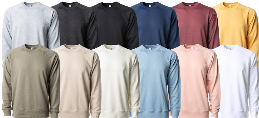
Athletic Heather, Charcoal Heather, Black, Indigo, Port, Harvest Gold, Olive, Sand, Bone, Misty Blue, Rose, White